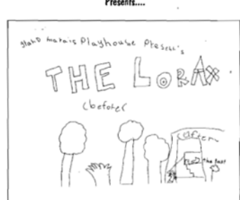
Sunday, August 5, 2001