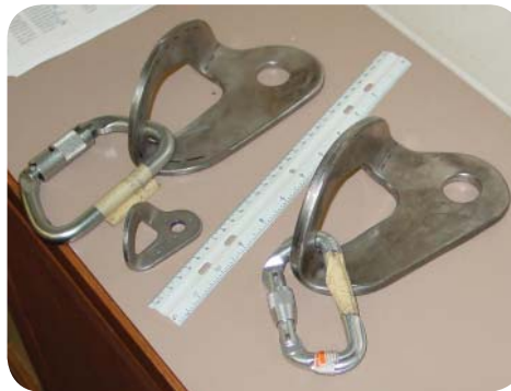
DNR designed anchors, and one standard anchor for comparison

by climbing groups, and improves both the safety and accessibility of the site.