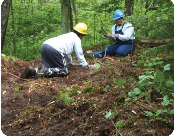
Minnesota Conservation Corps members help clear trails

The Minnesota Conservation Corps helped build the trails. An Eagle Scout candidate built 18 benches from trees removed on the site, while another candidate created 20 trail signs. Restroom facilities were installed to allow for longer field trips and learning visits. Over 270