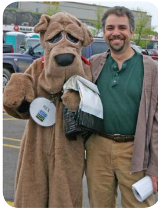
Rex the dog, star of RSPT's advertisements, was on hand to greet people at the Festival

an annual basis. There was substantial support for the Festival from community organizations and businesses. Area businesses appreciated an opportunity to interact with an audience who do not normally attend environmental events.