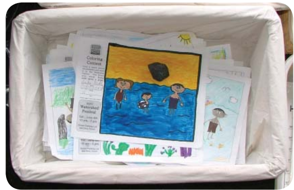
A coloring contest, distributed via local schools and the Duluth News Tribune, brought many families to the Festival