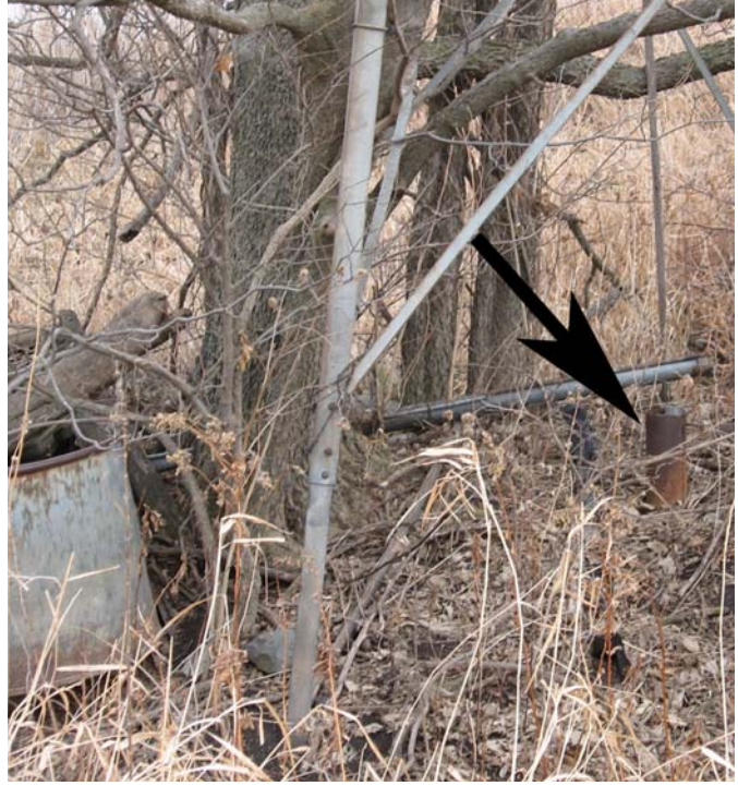
Figure 1. The windmill and open, rusty well casing (shown the by arrow) mark this abandoned well. This is a potential access point for contaminants.

The DNR administers more than 5 million acres of land. This is 95 percent of the state-managed land in Minnesota or approximately 10 percent of the state's entire land area. Many of the wildlife management areas, state forests, and state parks were farmsteads that the DNR acquired before well sealing regulations were established. After acquiring the farmsteads, the DNR usually demolished or burned the buildings, often without having the wells properly sealed. After the well sealing program was initiated, these sites were systematically searched for abandoned wells (Figure 1). If a well was found, it was sealed by a licensed contractor, returned to service, or left unsealed in rare circumstances. Wells were not sealed if they were considered a very low risk to groundwater contamination and were located in areas where road or access to the well site had been destroyed. When