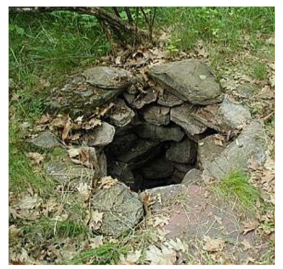
Figure 3. An uncovered dug well on an abandoned farmstead. Lined by stone, bricks, or concrete, well holes can be 3 feet to 10 feet in diameter and excavated below the water table. A dug well without a cover presents a hazard for humans and animals and a water contamination risk.

• The investigation process began by reviewing information on abandoned farmsteads and possible well sites that had been identified by respective DNR land unit managers (from Wildlife, Parks, Trails and Waterways, scientific and natural areas, and Forestry). This information generally identified the approximate location of an abandoned well or a farmstead of a well.