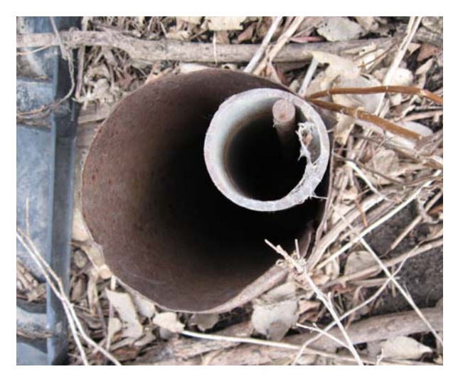
Figure 2. Looking down from above at the well casings and pump rod that have to be removed from the well before the well is sealed against contaminants.

casings begin to corrode and crumble from age (Figure 2). Surface runoff can then drain directly through the well into the aquifer, bypassing the natural filtration that normally occurs when surface water slowly percolates through the soil to the aquifer. A rapid transfer of surface water to the aquifer greatly increases the likelihood that natural or anthropogenic contaminants will be introduced into the ground-water system. One of the key strategies of the 1989 Minnesota Ground Water Protection Act is to protect ground-water quality by preventing its contamination, and this is exactly what the well sealing program has done.