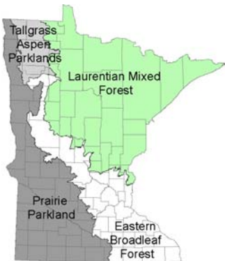
Figure 2. The four ECS Provinces in Minnesota.

Before the annual survey begins, volunteers are assigned a route (Fig. 1), provided with instructions, route maps, route descriptions, and field data sheets, and are asked to complete NAAMP's online frog and toad call identification quiz. This quiz can be taken until a passing score is reached and only includes species that may occur on their route. New volunteers are given the Calls of Minnesota's Frogs and Toads CD. Each route is run three times within designated periods (early spring, late spring, and summer) to encompass the variation in calling periods among frog and toad species. Surveys are run after dark under favorable weather conditions (water temperature is above a preferred minimum value, and wind is less than 8 mph). Frog calls are noted at each stop (10 stops/route, stops are a minimum distance of 0.5 miles apart). Volunteers listen at each stop for at least 5 minutes to distinguish calls of all the frog and toad species heard, and record their data on the field data sheet.