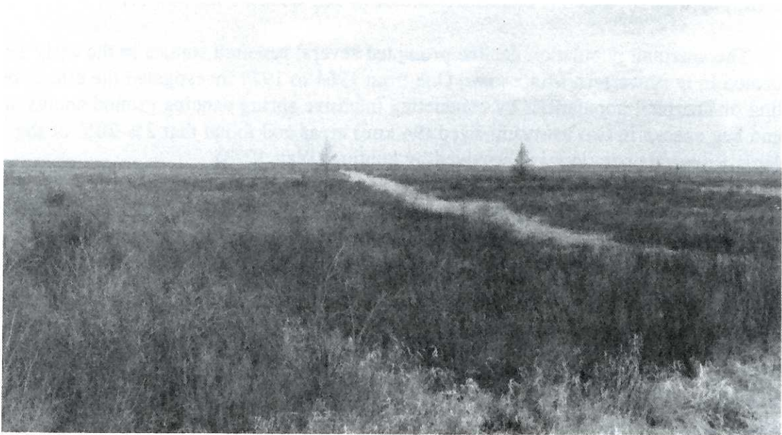
Figure 3b. Boreal peatland muskeg sharp-tailed grouse habitat typically found in large undeveloped glacial lake beds in Minnesota.