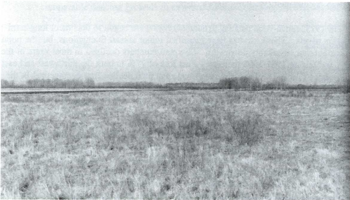
Figure 3a. Typical sharptail habitat in Minnesota, showing the open grass and brush vegetation types.