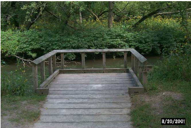
Fig. 3 - The accessible pier at Whitewater State Park.