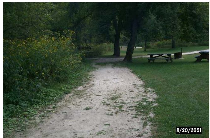
Fig. 4 - The path from the parking area to the pier is compact dirt and almost level.