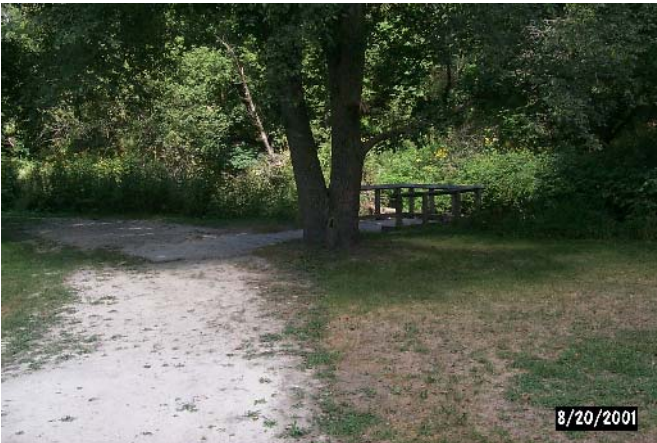
Fig. 1 - Trail to established pier. Pier is located in a shady spot.

There is a fishing pier along the Middle Branch Whitewater River located in Whitewater State Park. It can be accessed from the parking lot and road behind the Visitors Gift Shop. There is a picnic area close to the pier. A State Park sticker is required.