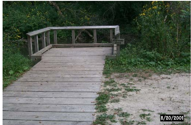
Fig. 2 - The approach to the pier is compact dirt and wooden planks.