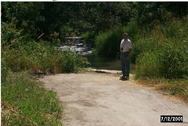
Fig. 1 - The approach is compact dirt and at a very slight angle. It offers fishing over under cut banks.

There are 6 accessible sites along a 1/4 mile stretch of Duschee Creek located between the DNR Laneboro Area Fisheries Office and the State Fish Hatchery. Sites are along a gravel road and offer good trout fishing opportunities. Several areas offer pullout spots that allow for fishing near under cut banks.