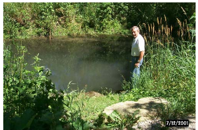
Fig. 4 - Some sites are a little less developed but can still offer some accessibility. Ground is compact.