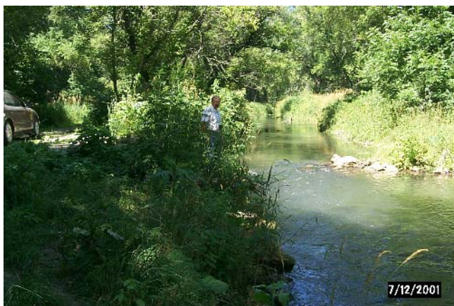
Fig. 3 - Some sites offer a pull out on compact dirt, and some shade part of the day.