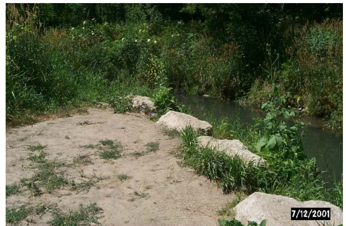
Fig. 2 - The approach is compact dirt and mostly level. It offers fishing over under cut banks.