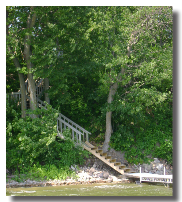
Vegetation surrounding a stairway: Mature vegetation above and around this zig-zag stairway protects the slope from erosion.

Native trees, shrubs, and groundcover serves many important functions. Along the shoreline, it acts as a buffer to protect water quality, preserve habitat for fish and wildlife, enhance property values, and contributes to the scenic beauty of riparian home sites. On steep slopes and bluffs, vegetation is the first line of defense for stabilizing fragile soils; minimizing erosion; and slowing storm water runoff near rivers, lakes, and wetlands.