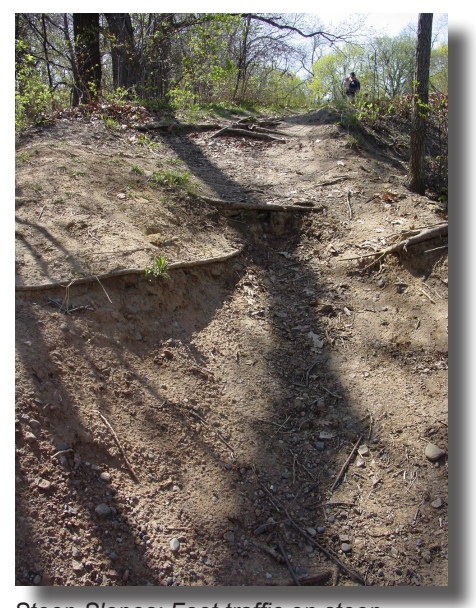
Steep Slopes: Foot traffic on steep slopes can lead to soil compaction and erosion.

Lifts: (right) Note how the lack of adequate vegetation to the side and below the base of the lift leads to severe erosion.