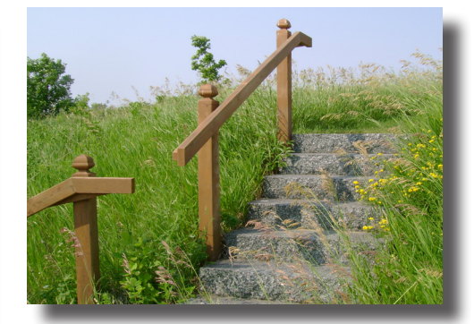
Stairway (above) This at-grade stone stairway is surrounded by thick vegetation that minimizes the impact of runoff.

Stairways: (left) The stairway angling back and forth on the slope, with landings, as well as ample vegetation, reduces erosion from runoff. Landings and two railings on the angled stairway make it more accessible.