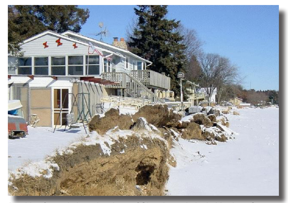
Ice ridge formed along the shore of Shamineau Lake in Morrison County.

Property owners occasionally return to their cabins in the spring only to discover they are dealing with property damage caused by a phenomenon called "ice heaving" or "ice jacking". This powerful natural force forms a feature along the shoreline known as an "ice ridge". The result may include significant damage to retaining walls, docks and boat lifts, and sometimes even to the cabin itself.