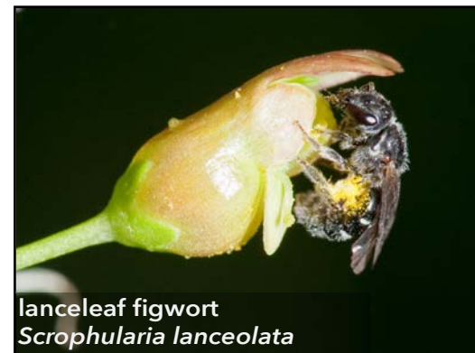
lanceleaf figwort Scrophularia lanceolata