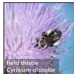
field thistle Cirsium discolor