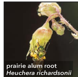
prairie alum root Heuchera richardsonii