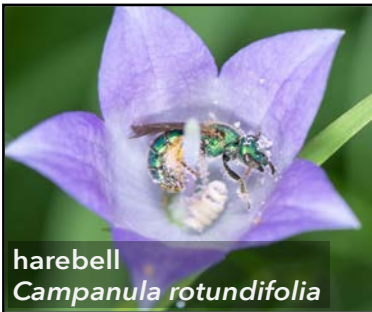
harebell Campanula rotundifolia

Forb diversity is one of the best predictors of bee community diversity. The vast majority of flowering plants used in restorations come from only three plant families: asters (Asteraceae), mints (Lamiaceae), and legumes (Fabaceae). We know that other plant families can be particularly attractive to bees, especially the rose (Rosaceae) and bellflower (Campanulaceae) families. Below are species that represent these important families and are known to be attractive to bees.