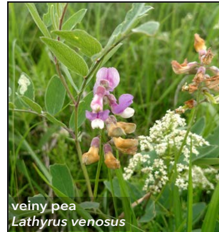
veiny pea Lathyrus venosus

Early blooming flowers are critical to bee conservation. However, early blooming plants are notoriously difficult to source and establish in prairie reconstructions. Early blooming flowers are critical to bee conservation. A number of bee species are active only in the spring. Spring is also when bumble bee queens are emerging and establishing colonies. This can be one of the most sensitive times in colony development, as the queen must establish and provision a nest without assistance of the workers that will follow later in the year. Stresses at this time of the year could be particularly disastrous for bumble bee populations.