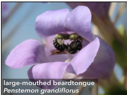
large-mouthed beardtongue Penstemon grandiflorus