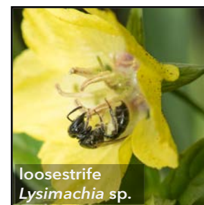
loosestrife Lysimachia sp.