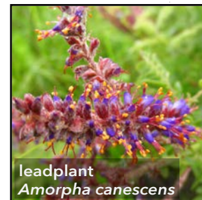
leadplant Amorpha canescens