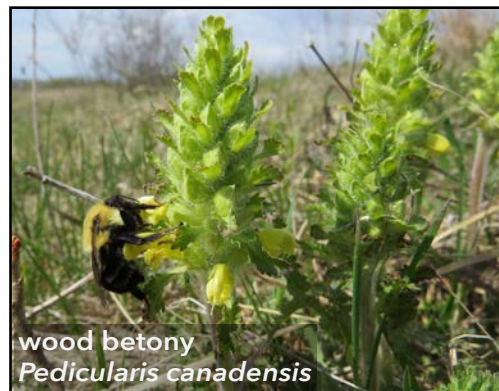
wood betony Pedicularis canadensis