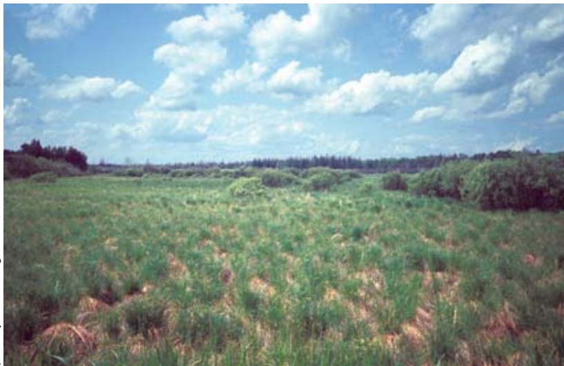
Cass County, MN