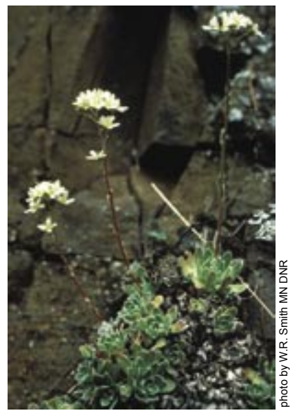
Encrusted saxifrage (Saxifraga aizoön)

Open communities on mesic, moderately acidic cliffs composed of quartz sandstone. Several localized examples are present along the Kettle River in the vicinity of Banning State Park in WSU, and possibly on Fond du Lac Sandstone along the lower St. Louis River in southwest Duluth in SSU. There are few records available on the plant species composition of CTn32e.