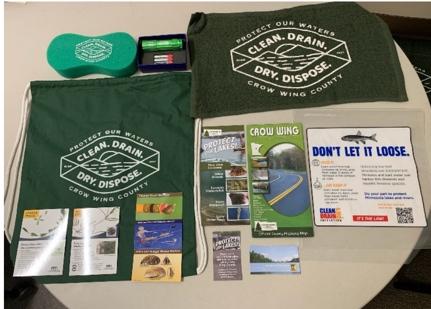
Figure 1 – Watercraft equipment starter kit

Crow Wing County implemented our pilot program test in the summer of 2021. This pilot program targeted anglers at fishing tournaments and high-use public landings. Watercraft inspectors then discussed the County's pilot program to educate them on proper ways to dispose of live bait correctly and cleaning watercrafts properly. Once anglers heard about the pilot program they would be asked to make a commitment to dispose of live bait correctly and clean watercrafts properly. The anglers would either make a verbal or written commitment which would be considered as a pledge to receive a watercraft equipment starter kit.