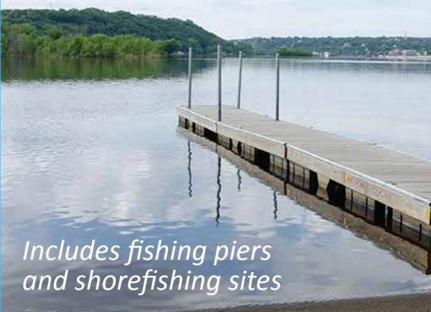
Includes fishing piers and shorefishing sites