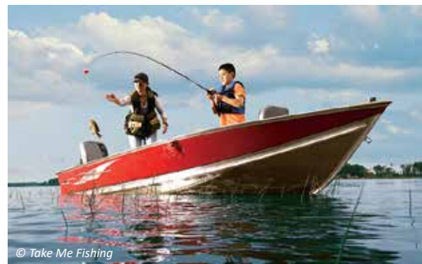
Persons with disabilities may request this information in an alternative format.

Minnesota State Parks and Trails-Grand Rapids (218) 999-7923