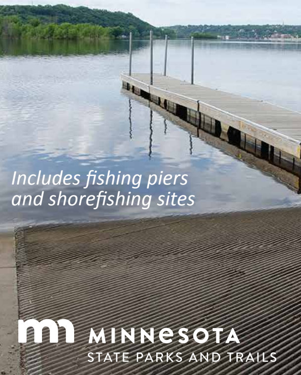
Includes fishing piers and shorefishing sites