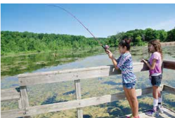
Photos: Minnesota Department of Natural Resources, unless otherwise noted. Persons with disabilities may request this information in an alternative format.