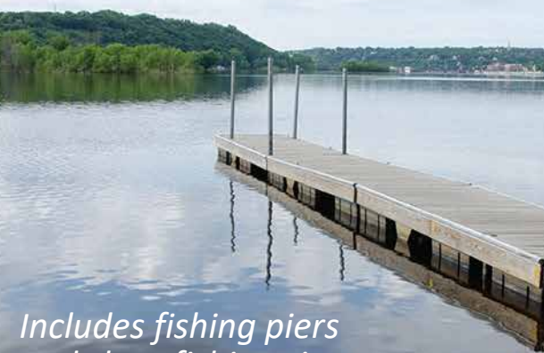
Includes fishing piers and shorefishing sites