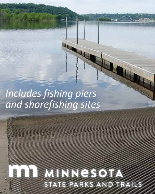
Includes fishing piers and shorefishing sites