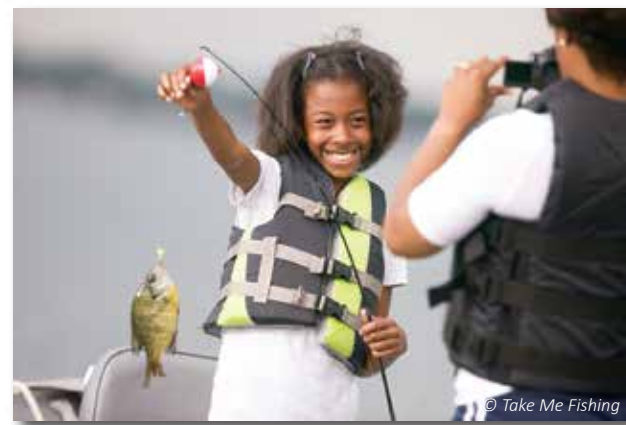
Take Me Fishing

Licensing - All motorized and non-motorized watercraft must be licensed by the Department of Natural Resources (DNR). Please contact the DNR License Bureau for information.