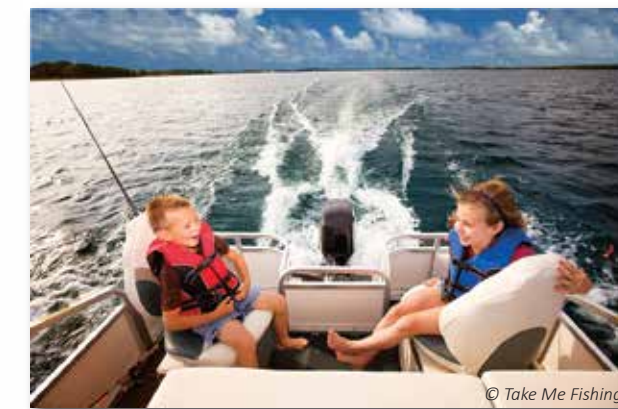
Take Me Fishing

Fish Species: C — Crappie, CF — Catfish, LB — Largemouth Bass, N — Northern Pike, S — Sunfish, W — Walleye, Wildlife — Wildlife Lake