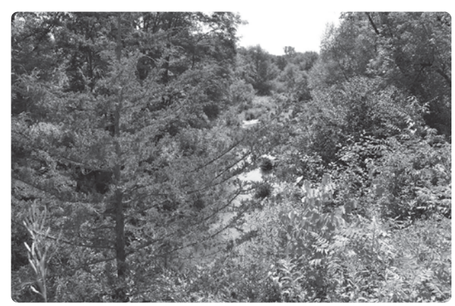
Overlooking Hay Creek on the north segment

Minnesota Department of Natural Resources Information Center 500 Lafayette Rd. St. Paul, MN 55155-4040 888-646-6367 | mndnr.gov/trails