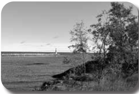
The park offers a unique and peaceful experience along Lake of the Woods.

Zippel Bay State Park was created in 1959 to offer recreational access to Lake of the Woods. The ocean-like lake comprises the boundary between the United States and Canada. Lake of the Woods played a key role in the exploration, fur trade and eventual settlement of the Zippel Bay area. With 14,000 islands and 1,485 square miles of water, recreational opportunities are endless. Come for walleye fishing, birdwatching, boating, camping, diverse wildlife or to relax along the sandy shoreline.