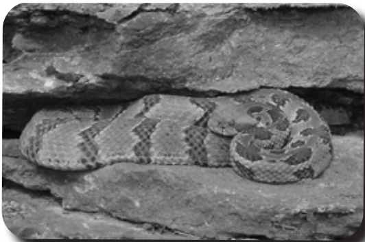
The timber rattlesnake is a threatened bluffland species sometimes seen in the park in late summer. Report sightings to the park office.

Established in 1919, the park protects one of the most scenic sections of the historic Whitewater Valley. Rare geology in this unglaciated Driftless Area supports diverse ecosystems, dramatic landscapes and unique recreational opportunities. Much of the park was developed by the Civilian Conservation Corps and the Works Progress Administration as a result of the Great Depression. Today, the park welcomes over 250,000 visitors each year and serves as a gateway and information center for the nearby 27,000-acre Whitewater Wildlife Management Area. An active Friends Group helps support many park projects and activities.