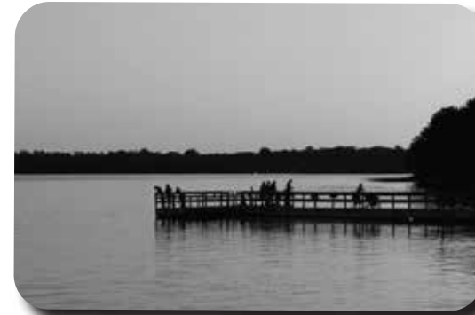
Swim, fish or picnic along Lake Andrew.

Sparked by the support of local citizens, the park has protected the area's rolling glacial hills, beautiful lakes, and diverse wildlife since 1919. Over the years, the park has expanded to include high quality maple-basswood forests, prairies, wetlands and oak savanna. Roads, trails and facilities were developed by a Veteran's Conservation Corps (VCC) crew during the New Deal era. The crew worked here under the direction of the National Park Service from 1935 to 1938. These workers left behind a legacy that you can still experience when you visit the park today. Their project also set the stage for continuing growth and improvement.