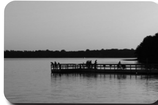
Swim, fish or picnic along Lake Andrew.

Sparked by the support of local citizens, the park has protected the area's rolling glacial hills, beautiful lakes, and diverse wildlife since 1919. Over the years, the park has expanded to include high quality maple-basswood forests, prairies, wetlands and oak savanna. Roads, trails and facilities were developed by a Veteran's Conservation Corps (VCC) crew during the New Deal era. The crew worked here under the direction of the National Park Service from 1935 to 1938. These workers left behind a legacy that you can still experience when you visit the park today. Their project also set the stage for continuing growth and improvement.