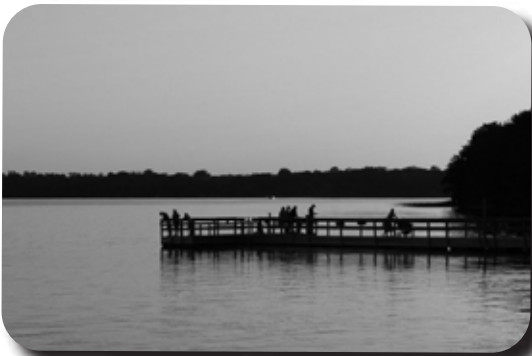
Swim, fish or picnic along Lake Andrew.

Sparked by the support of local citizens, the park has protected the area’s rolling glacial hills, beautiful lakes, and diverse wildlife since 1919. Over the years, the park has expanded to include high quality maple-basswood forests, prairies, wetlands and oak savanna. Roads, trails and facilities were developed by a Veteran’s Conservation Corps (VCC) crew during the New Deal era. The crew worked here under the direction of the National Park Service from 1935 to 1938. These workers left behind a legacy that you can still experience when you visit the park today. Their project also set the stage for continuing growth and improvement.