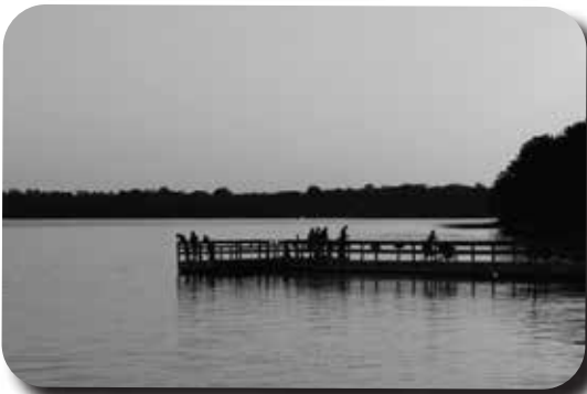
Swim, fish or picnic along Lake Andrew.

Sparked by the support of local citizens, the park has protected the area's rolling glacial hills, beautiful lakes, and diverse wildlife since 1919. Over the years, the park has expanded to include high quality maple-basswood forests, prairies, wetlands and oak savanna. Roads, trails and facilities were developed by a Veteran's Conservation Corps (VCC) crew during the New Deal era. The crew worked here under the direction of the National Park Service from 1935 to 1938. These workers left behind a legacy that you can still experience when you visit the park today. Their project also set the stage for continuing growth and improvement.