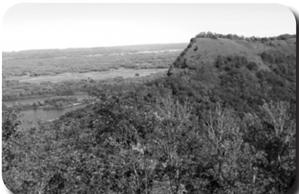
Enjoy spectacular views of the blufflands.

Visit the park and explore diverse plant communities including maple-basswood forests, old hickory, pines, goat prairies and old fields. Experience this unique landscape while you hike, camp, birdwatch, picnic, snowshoe or ski.