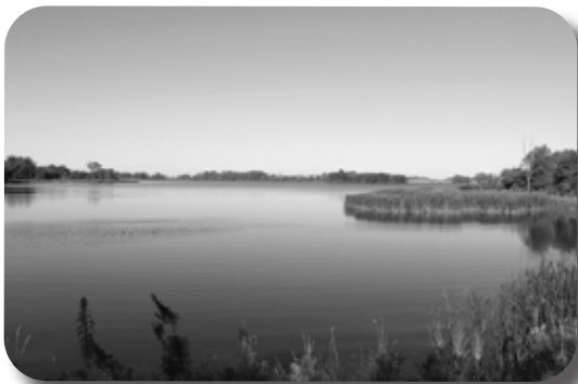
Enjoy the park’s quiet lakes.

This park was created in 1923 in memory of victims of the U.S.-Dakota War of 1862. Today, the site serves as a personal reminder of our Minnesota history. Visit for a quiet experience in a small state park. You will be surrounded by lakes with secluded paddling opportunities and wooded trails perfect for hiking.