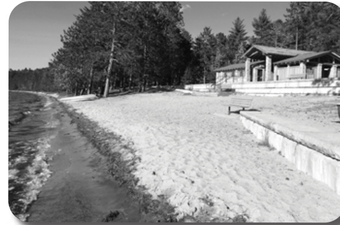
Spend hours at the park's sugar sand beach.