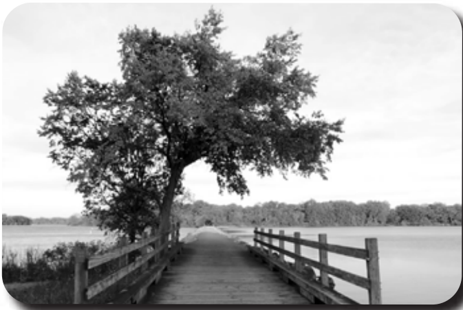
There is so much to see at Lake Shetek.

Created in 1937, the park gives you access to the largest lake in Southwest Minnesota. Lake Shetek has long drawn humans. The first to farm and settle here were of the Great Oasis culture around 900-1100 A.D. The Dakota people, who had their homes around the lakes and prairies, came into contact with European explorers in the 1840s. Immigrants later created a settlement along the lake that came to an end during the tragic U.S./Dakota War of 1862. During your visit you may see reminders of this time. Today, the park offers you opportunities to make new memories in this historic place. Camp, fish, swim, hike, paddle and more.