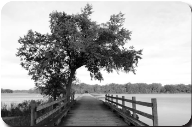
There is so much to see at Lake Shetek.

Created in 1937, the park gives you access to the largest lake in Southwest Minnesota. Lake Shetek has long drawn humans. The first to farm and settle here were of the Great Oasis culture around 900-1100 A.D. The Dakota people, who had their homes around the lakes and prairies, came into contact with European explorers in the 1840s. Immigrants later created a settlement along the lake that came to an end during the tragic U.S./Dakota War of 1862. During your visit you may see reminders of this time. Today, the park offers you opportunities to make new memories in this historic place. Camp, fish, swim, hike, paddle and more.