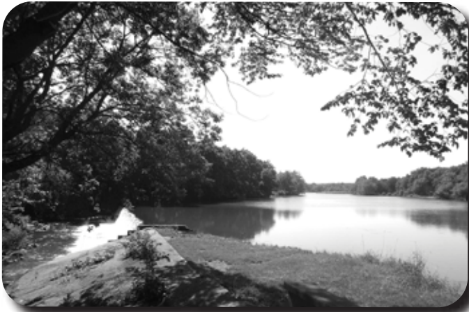
Swim, paddle and fish at Lake Louise.

The park's lake was created when early settlers built a dam on the Upper Iowa River to power a gristmill, an important business for the growing frontier community of Le Roy. Later in time, the Hambrecht Family donated several acres along the lake as a recreation area called Wildwood Park. The lake was named "Louise" after a family member. The city of Le Roy donated Wildwood Park to the state in 1962, and Lake Louise State Park was established. Today, at 849 acres, the park offers woodlands and restored prairies with abundant wildflowers and wildlife. The park also includes the confluence of the Upper Iowa and Little Iowa rivers and features numerous sinkholes.