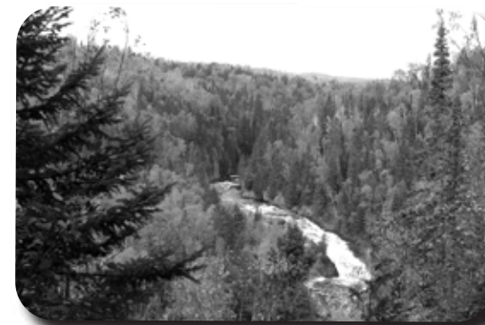
Scenic landscape abounds at this park.

In 1957, over 900 forested acres along the Brule River were set aside as Brule River State Park. In 1963, it was renamed as a memorial to the late Judge Magney. A lawyer, mayor of Duluth, and a justice of the Minnesota Supreme Court, he was a strong advocate of Minnesota State Parks, especially along the North Shore. Today, you can experience over 4,000 acres of rugged landscape in the park. Hike the trails, fish the waters or camp. The campground still holds the foundations of a 1934 camp that gave work and lodging to men during the Depression. Whatever your interest, enjoy the spectacular scenery during your stay.