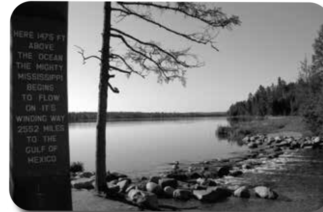
Wade amongst the first drops of water to flow to the Gulf of Mexico.

At over 32,500 acres, Itasca State Park includes not only the beginning of the Mississippi River, but large tracts of Minnesota's remaining old-growth red and white pine forest. Established in 1891, Itasca is Minnesota's oldest state park and was created to protect the forests and waters surrounding the Headwaters of the Mississippi River. Shaped by glaciers over 10,000 years ago, the rolling landscape conceals over 100 lakes within the pine, spruce, birch, oak and maple forests. Centuries of disputes over what lake was the true source of the great river led park founder Jacob V. Brower to settle the dispute once and for all, determining that Lake Itasca is the headwaters of the Mississippi River.