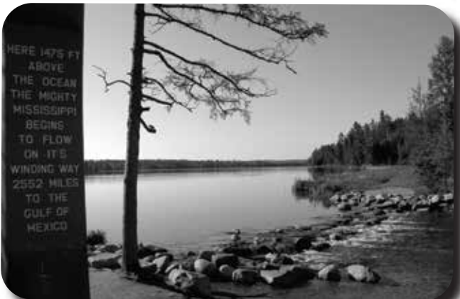
Wade amongst the first drops of water to flow to the Gulf of Mexico.

At over 32,000 acres, Itasca State Park includes not only the beginning of the Mississippi River, but large tracts of Minnesota's remaining old-growth red and white pine forest. Established in 1891, Itasca is Minnesota's oldest state park and was created to protect the forests and waters surrounding the headwaters of the Mississippi River. Shaped by glaciers over 10,000 years ago, the rolling landscape conceals over 100 lakes within the pine, spruce, birch, oak and maple forests. Centuries of disputes over what lake was the true source of the great river led park founder Jacob V. Brower to settle the dispute once and for all, determining that Lake Itasca is the headwaters of the Mississippi River.