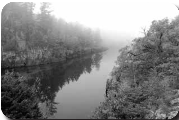
Walk along cliffs of ancient lava.

Interstate State Park includes 293 acres of diverse plant and wildlife habitat. Established in 1895, it protects a unique landscape and globally-significant geology along the St. Croix River. A billion years ago, dark basalt rock formed here when lava escaped from a crack in the earth's crust. Just ten thousand years ago, water from melting glaciers carved the river valley. Within that water were fast moving whirlpools of swirling sand and water that wore deep holes into the rock. Today, we call these holes glacial potholes and you can see more than 400 examples of them at the park.