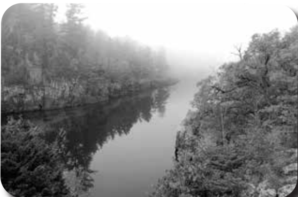
Walk along cliffs of ancient lava.

Interstate State Park includes 293 acres of diverse plant and wildlife habitat. Established in 1895, it protects a unique landscape and globally-significant geology along the St. Croix River. A billion years ago, dark basalt rock formed here when lava escaped from a crack in the earth's crust. Just ten thousand years ago, water from melting glaciers carved the river valley. Within that water were fast moving whirlpools of swirling sand and water that wore deep holes into the rock. Today, we call these holes glacial potholes and you can see more than 400 examples of them at the park.