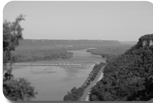
High above the Mississippi River.

Full of Mississippi River vistas, this park bears the name of the philanthropic Winona grocer who donated the land to the state in 1925. The park's convenient location and small footprint have made it a favorite stopping point for people traveling between La Crosse, Wisconsin and Red Wing, Minnesota. The park was once classified as a state scenic wayside and is unique in not requiring a state park permit today. The park's hiking trail was created by the Civilian Conservation Corps in 1933. Enjoy the beautiful views you will find there.