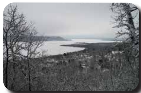
Discover impressive views.

Immerse yourself in rich natural communities and diverse landscapes during a trip to Frontenac State Park. Experience over 2,600 acres of bluffs, prairie, floodplain forests and hardwood forest. The area's resources have drawn civilizations since 400 B.C. when the Hopewell culture was here. Later, the area was used for fur trading, stone quarrying and farming. Visit the park in spring or fall and you'll be in one of the best spots in the country to view bird migrations. Hikers and skiers can also enjoy spectacular views of the river valley and Lake Pepin.