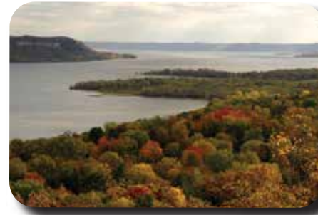
Discover impressive views.

Immerse yourself in rich natural communities and diverse landscapes during a trip to Frontenac State Park. Experience over 2,600 acres of bluffs, prairie, floodplain forests and hardwood forest. The area's resources have drawn civilizations since 400 B.C. when the Hopewell culture was here. Later, the area was used for fur trading, stone quarrying and farming. Visit the park in spring or fall and you'll be in one of the best spots in the country to view bird migrations. Hikers and skiers can also enjoy spectacular views of the river valley and Lake Pepin.