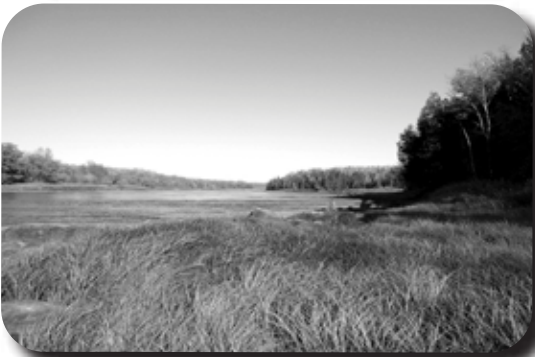
Experience incredible views during your stay.

Enjoy serene, picturesque views of Ontario, Canada and the Rainy River. Hike trails that stretch through a mixed forest with jack pine and birch. Listen for songbirds and woodpeckers as they fill the forest with sound. Keep your eyes out for pelicans on the water and bald eagles roosting in the trees. Beaver, wolf, and moose have also been sighted in this park.