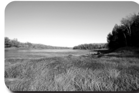
Experience incredible views during your stay.

Enjoy serene, picturesque views of Ontario, Canada and the Rainy River. Hike trails that stretch through a mixed forest with jack pine and birch. Listen for songbirds and woodpeckers as they fill the forest with sound. Keep your eyes out for pelicans on the water and bald eagles roosting in the trees. Beaver, wolf, and moose have also been sighted in this park.