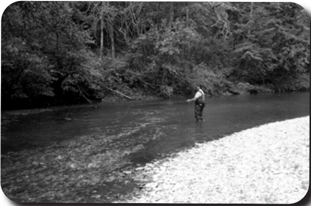
Anglers and visitors delight in the park's cool, clear streams.

Forestville/ Mystery Cave State Park is one of the most diverse state parks in Minnesota. The park protects striking limestone bluffs and numerous karst features such as caves, sinkholes and springs. Take trails through closed canopy forests, oak woodlands and meadows. View remnant stands of native white pine dotting the slopes and rare pockets of balsam fir and Canada yew persevering on cool, north-facing bluffs. Anglers will enjoy the three sparkling trout streams that converge in the park. Tour an 1850s frontier village or Minnesota's longest known cave, both unique features for which the park was named. Stop in for the day or stay awhile by reserving a campsite, horse camp, group camp or camper cabin. Return in winter to snowshoe, fish or ski on rustic backcountry trails.