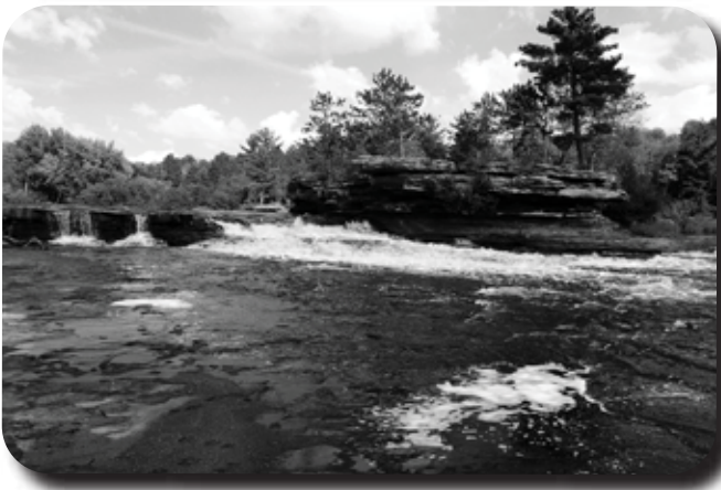
View the Kettle River’s many rapids from park trails.

Watch for wildlife, climb through unique geological formations, and visit two waterfalls during your stay. Stop along the Quarry Loop Trail to explore the ruins of a 130-year-old sandstone quarry. See the quarry wall that still bears the marks of steam-powered drills and find the skeletons of the rock crusher and power house buildings.