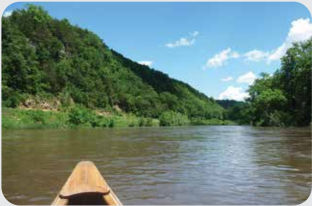
Paddle beneath the hills and cliffs of the Zumbro River.

Be aware that there are no campsites or rest areas in the ecologically sensitive Whitewater Wildlife Management Area of the Whitewater River.