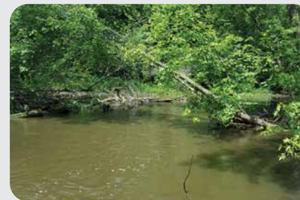
Beware of fallen trees at river bends.

Hazards include dams, logjams, overhanging trees and submerged snags.