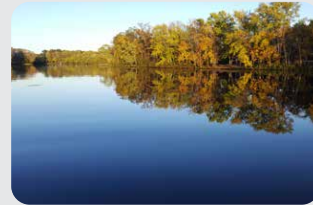
Hardwoods along the river make for a beautiful fall paddle.

White-tailed deer, black bear, gray and red fox, beaver and muskrat as well as an occasional otter can be found along the river. Ruffed grouse, numerous waterfowl and songbirds may be sighted as well.