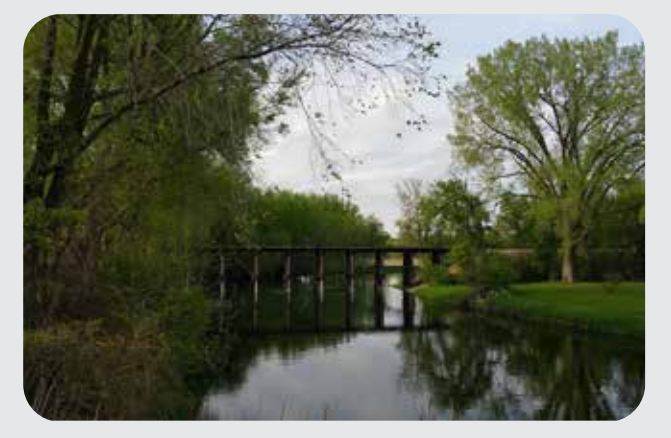
Flat water greets paddlers along much of this route.

Hazards include dams and a low bridge, be sure to know portage locations.