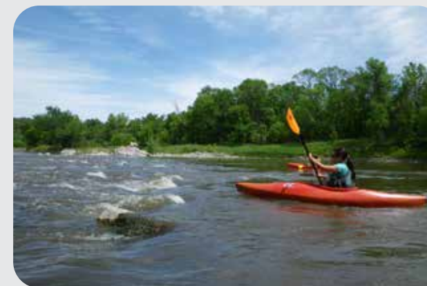
Pockets of rapids can be found along this stretch.

At the area around Redwood Falls, paddlers will encounter thick forest and high ridges that tower above the Minnesota River. Bordering the river is the recently created Whispering Ridge Aquatic Management Area, part of the effort of the Green Corridor Project to provide a trail system from Upper Sioux Agency State Park to Fort Ridgely State Park. You will also find a rock ledge that was once dynamited to allow steamboats upstream.