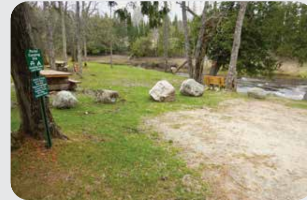
State forests offer camping opportunities.

Hazards for this segment include several Class I-II rapids. Some portages may be difficult due to overgrown brush.