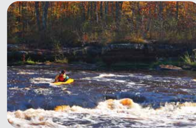
The river offers a wide range of paddling opportunities.

Hazards include Class I-IV rapids; be aware of their locations and ratings.