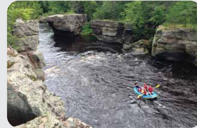
The river offers a variety of whitewater opportunities.

Hazards include Class I-IV rapids and an underwater trestle. Make sure you are aware of their locations and portage options.