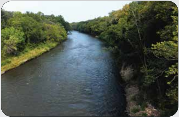
Follow the river's twist and turns through varied landscapes.

Hazards include dams; be sure you know their locations.